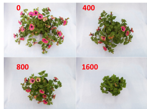
Augeo \geq 400 ppm resulted in smaller plants